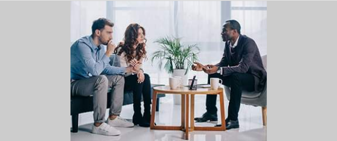
Marriage and family therapists encourage clients to discuss their emotions and experiences.

Marriage and family therapists diagnose and treat cognitive, behavioral, or similar disorders in the context of couples and other relationships.