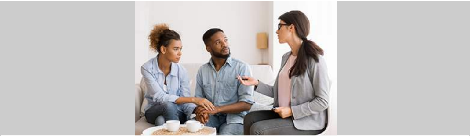
Master's programs in marriage and family therapy prepare students to provide counseling to couples, individuals, and groups.

Marriage and family therapists typically need a master’s degree to enter the occupation. Every state requires therapists to be licensed.