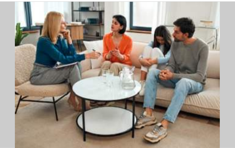
Many marriage and family therapists work in private practice.

Marriage and family therapists held about 76,000 jobs in 2023. The largest employers of marriage and family therapists were as follows: