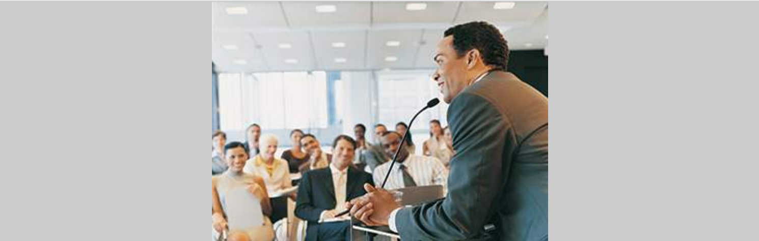
Social and community service managers meet with community members and funding providers to discuss their programs.

Social and community service managers coordinate and supervise programs and organizations that support public well-being. They direct workers who provide these services to the public.